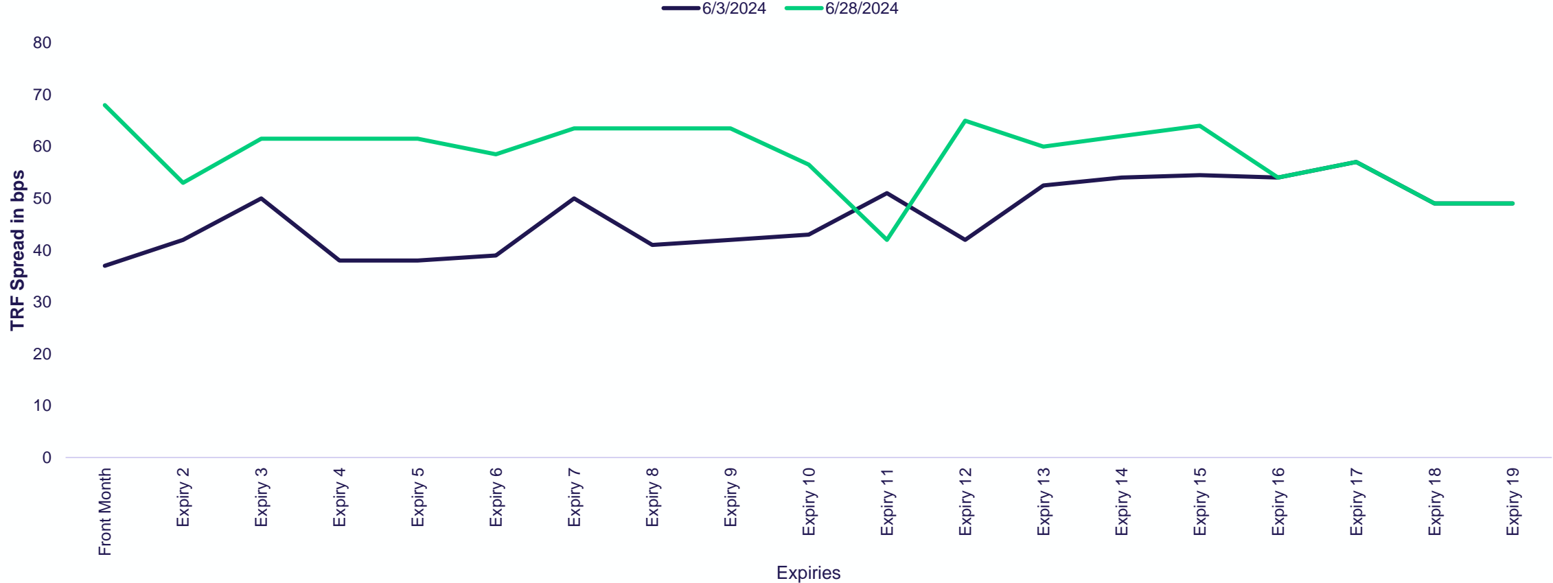
FTSE® 100 Index TRF (TTUK) Spread comparison

Relative steepness of the term structure provides trading opportunities