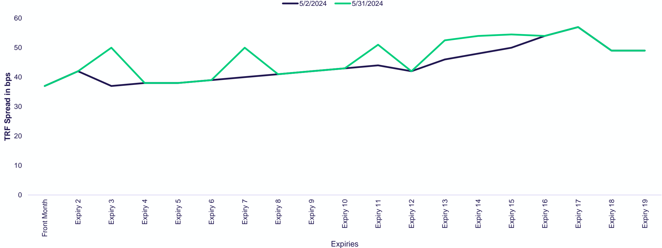
FTSE® 100 Index TRF (TTUK) Spread comparison

Relative steepness of the term structure provides trading opportunities